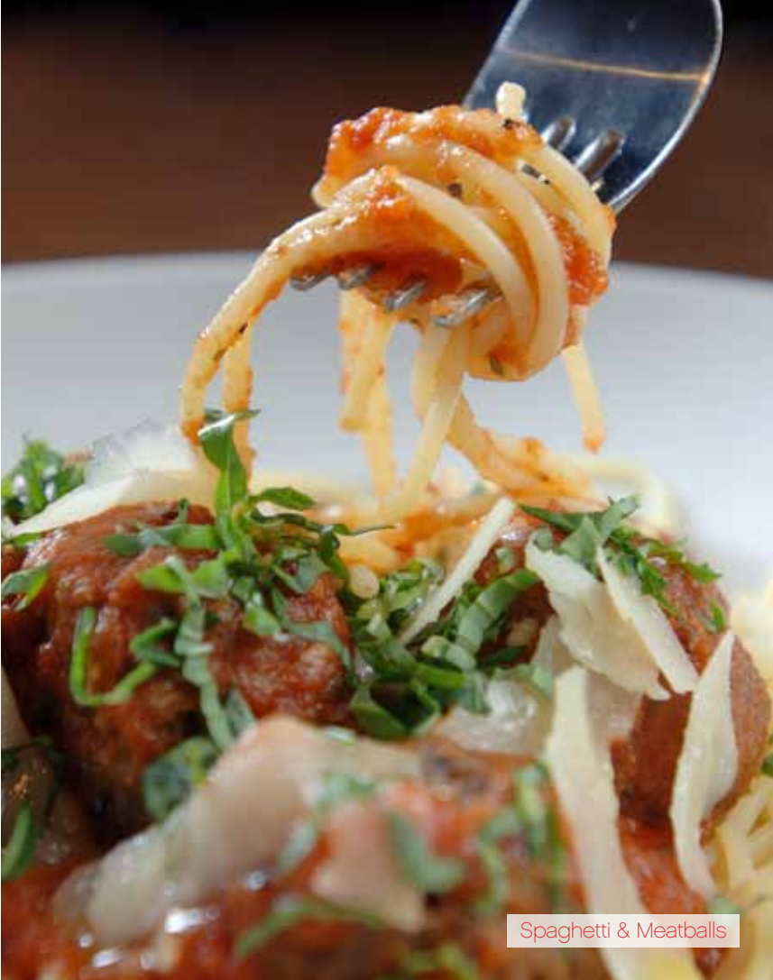
Spaghetti & Meatballs