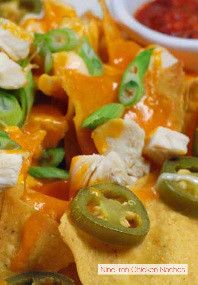
Nine Iron Chicken Nachos