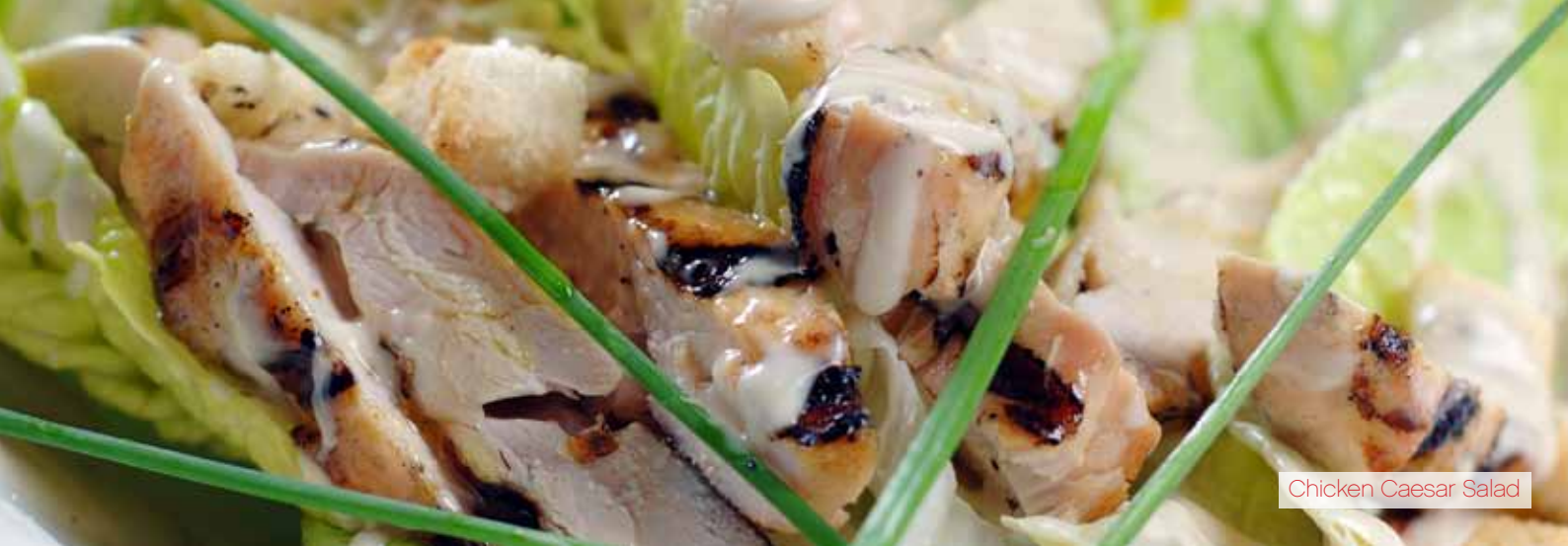
Chicken Caesar Salad