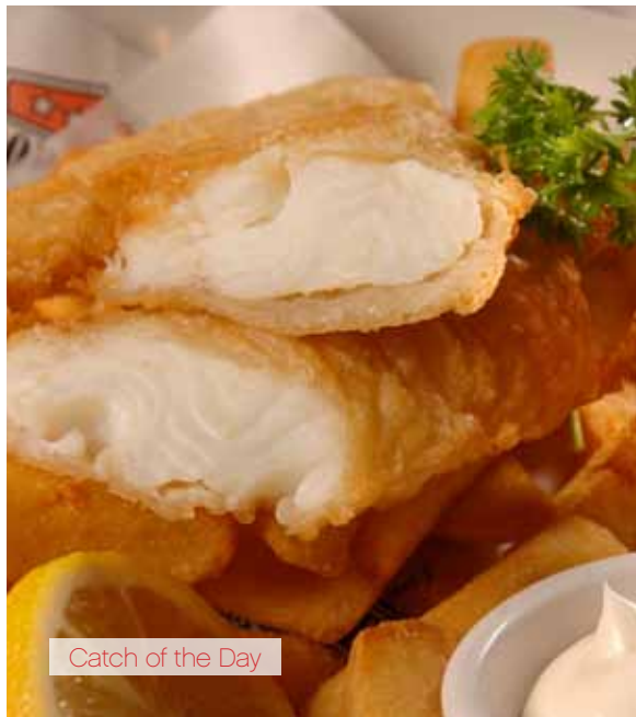
Catch of the Day