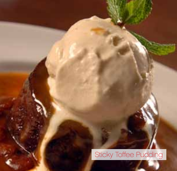
Sticky Toffee Pudding