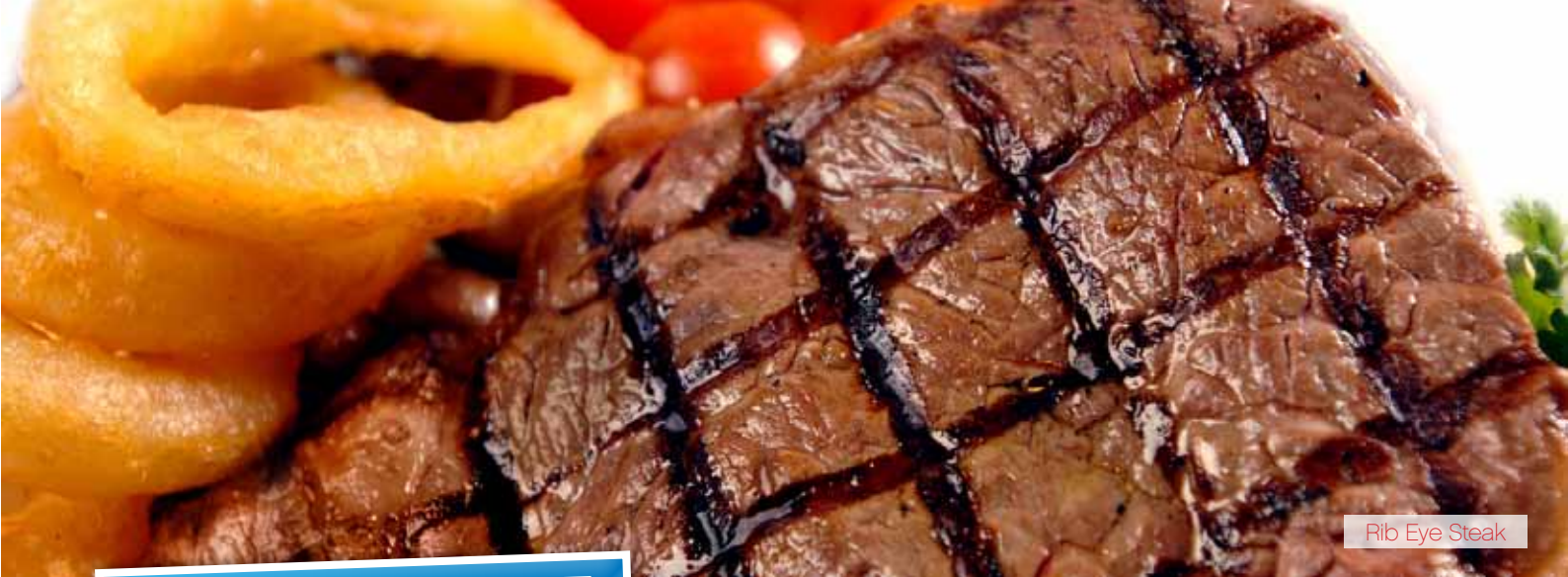
Rib Eye Steak