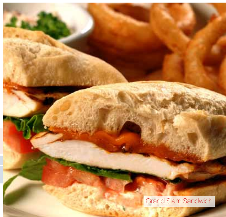
Grand Slam Sandwich