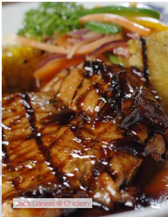
Jack Daniels ® Chicken

Swap Your Gourmet Fries or Loaded Baked Potato: Curly Fries £0.80 Onion Rings £1.00 House Side Salad £1.20