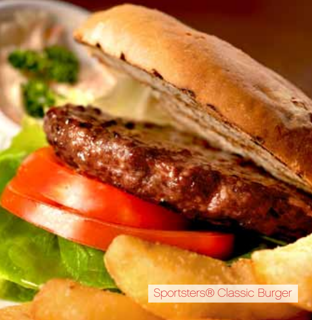
Sportsters® Classic Burger