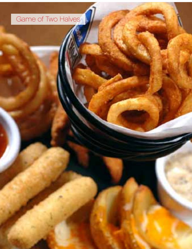
Game of Two Halves