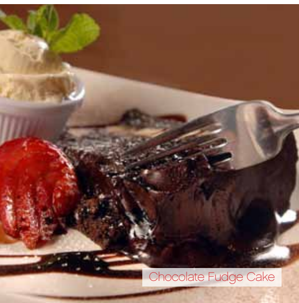
Chocolate Fudge Cake